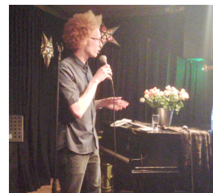
Sporadically I partake in comedy open-mic nights.